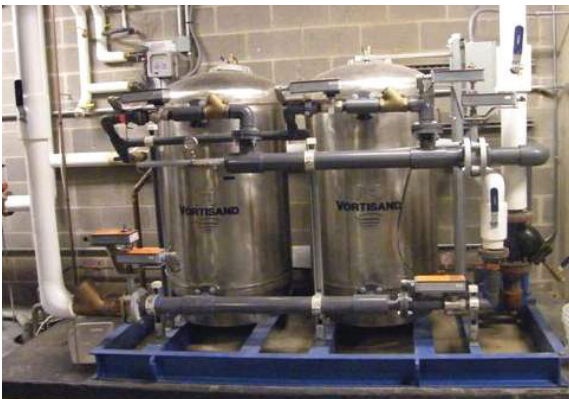
Printed in Canada